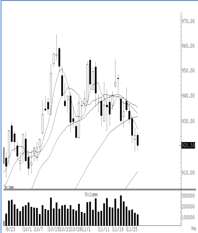
S50Z24 (Close 920.50 Chg -4.00)